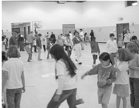
Students at Lane Elementary play word games in the gym.