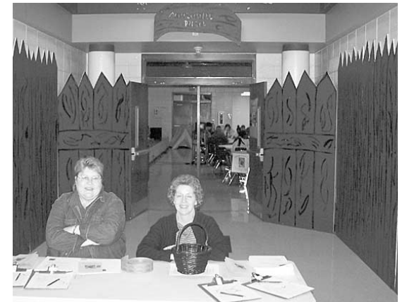
Weaver Middle's cafeteria was decorated by the art department to resemble the prison fort from the book.