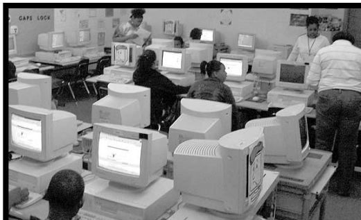
Miller Middle students spent two Saturdays reviewing test material and taking practice tests in the computer lab.

With such an important test looming, schools in Bibb County went above and beyond the normal instruction to help make sure their students were thoroughly prepared. Offering special test-taking sessions (some on