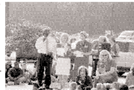
Heritage Elementary Administrators leading the students in patriotic songs.