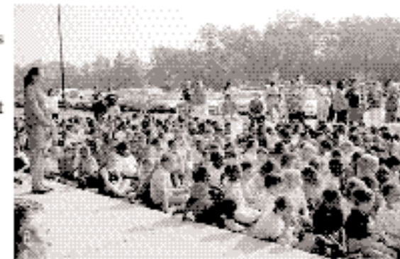
Heritage Elementary students gathered in front of the school to honor their heroes.

an American. Fifth grade students wrote messages of peace and placed them in balloons before releasing them into the air. One student's read, "I wish we could have more peace. I wish our family members did not have to go far way and fight. I wish all the countries would get along instead of being against one another. I wish we all could get along. I wish people could just live their lives...I wish...I wish for peace."