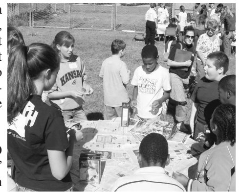
An array of educational activities were set up, including simulating an earthquake with graham crackers.