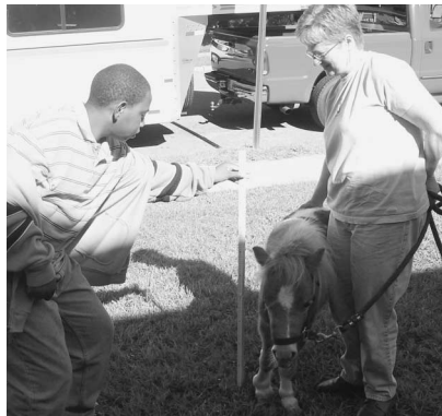
Elam students measured the height of a dwarf horse.

This year, more than 90 Sophomores have come to Elam, beginning their day with an orientation on what Elam Alexander Academy is and what services they offer. Even before stepping into the building, Gudenrath and faculty members traveled to Stratford to begin the students' education about the type of student they would be working with at Elam. The students then disperse into classrooms where they are paired up with an Elam student to help them through their work.